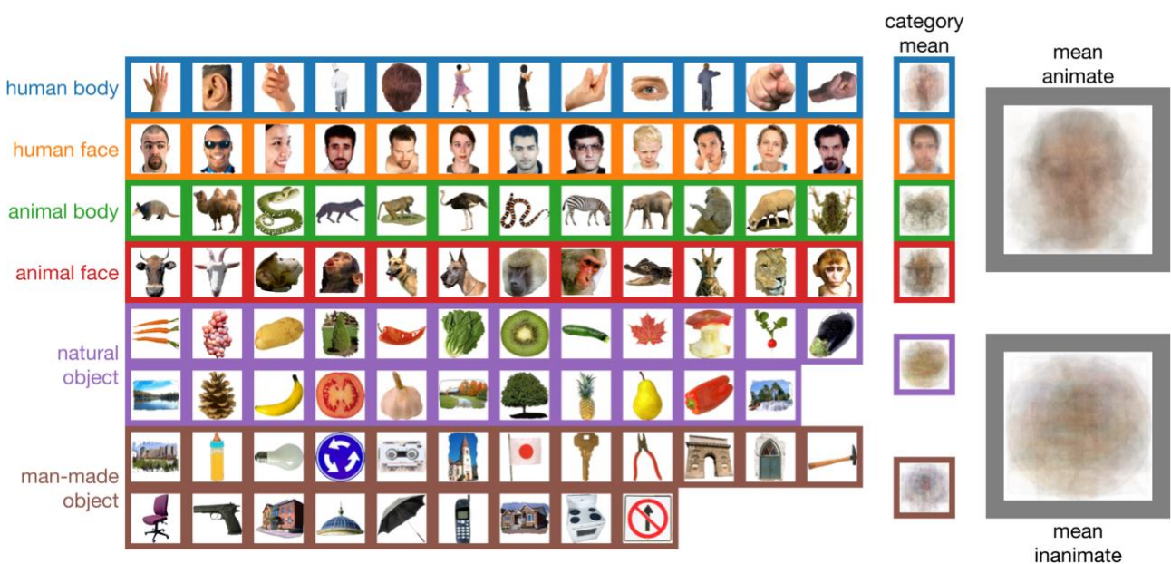
Figure 1. The 92-object stimulus set used in over 35 computational cognitive neuroscience papers. Some of the objects in the ‘animate’ category are not animate (e.g., hair; row 1 column 5, or a cut-out wolf figurine; row 3 column 4). Some inanimate images are not objects, but rather scenes (e.g., row 6/7 column 1). This stimulus set is often used to highlight a strong animate/inanimate dichotomy in human brain responses, but the categories have consistent visual differences (the rightmost two columns show the means of all images in a category).

These limitations would not constitute a huge problem on their own. They could be addressed in follow-up work that replicates results using a different stimulus set, or a set that specifically controls for the issues above. Indeed, several studies have used variations or entirely different sets to highlight contrasting and complementary findings (For a recent review, see Wardle and Baker, 2020). However, the problem arises because a large amount of published work has used the exact same stimulus set. This leads to a wide-spread issue of generalisability. In addition, the current academic landscape encourages only publishing positive results (Ioannidis et al., 2014), which could mean that we are getting a skewed picture of published results that are specific to the 92-object stimulus set.